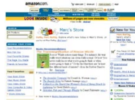
Figure 1. Insert a caption below each figure.

around them. You access these controls by selecting your picture, then choosing “Picture...” from the “Format” menu.