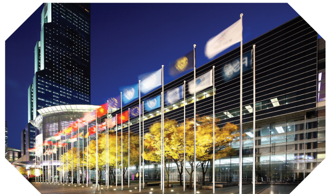
COEX Convention & Exhibition Center. site of CHI 2015

Carol Klyver ACM/CHI 2015 Exhibits Foundations of Excellence Pacifica, California, USA Tel: +1 650 738 1200 Email: exhibits@chi2015.acm.org